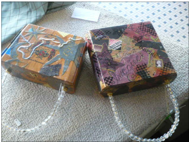
Multi Medium Collage Cigar Box